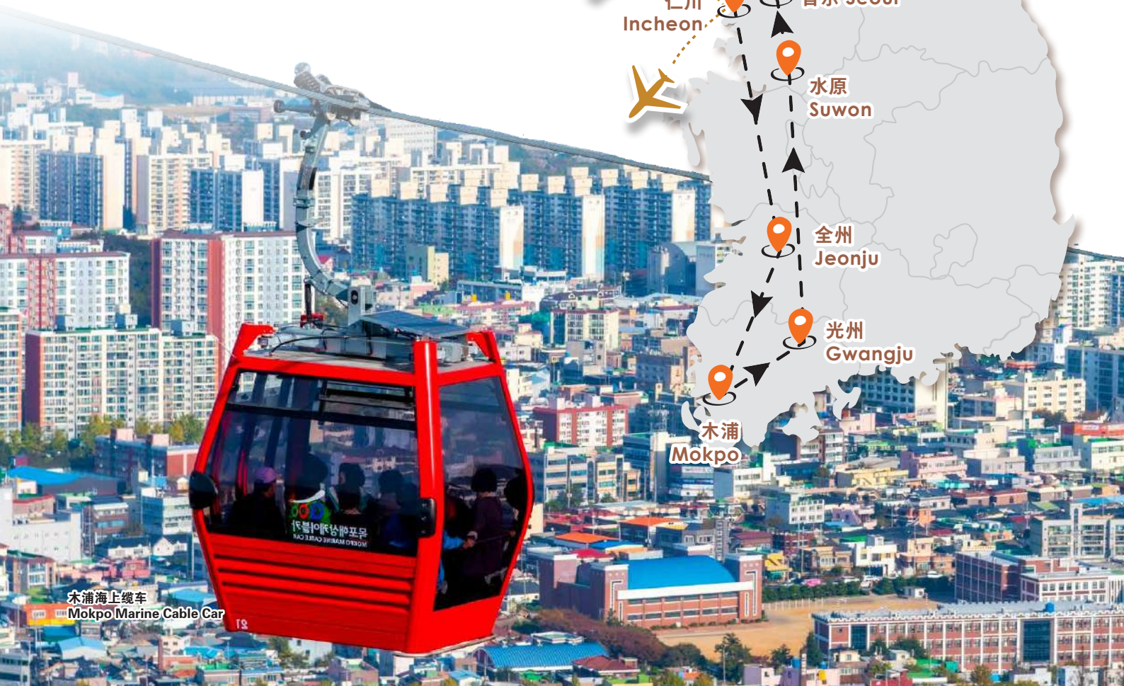
木浦海上缆车 Mokpo Marine Cable Car