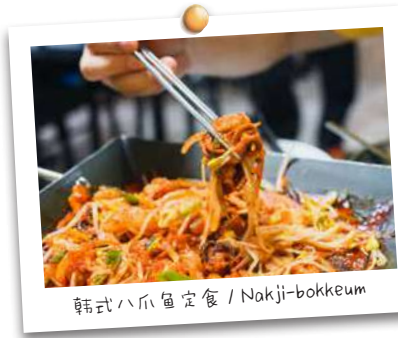
韩式八爪鱼定食 / Nakji-bokkeum