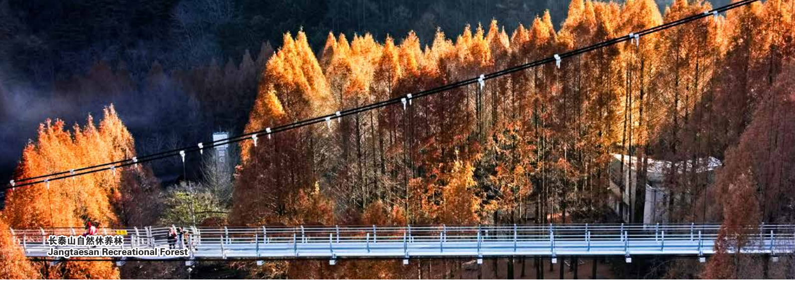
长泰山自然休养林 Jangtaesan Recreational Forest