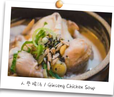
人参鸡汤 / Ginseng Chicken Soup