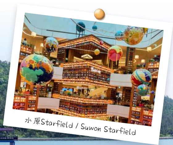
水原Starfield / Suwon Starfield