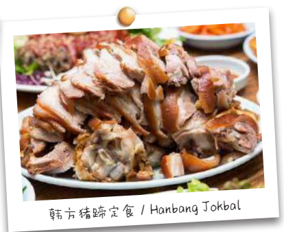
韩式猪蹄定食 / Hanbang Jokbal