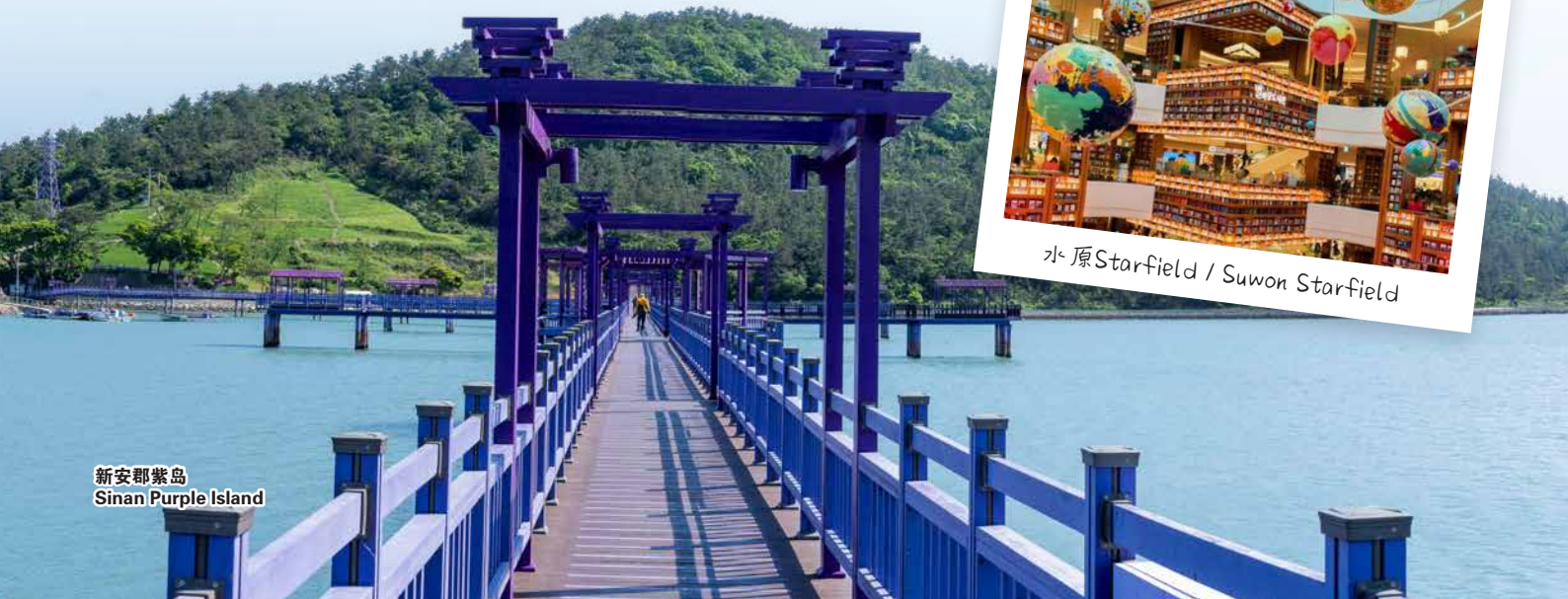
新安郡紫岛 Sinan Purple Island